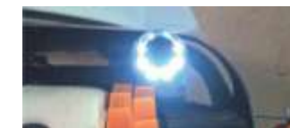
Waterproof IP68 camera with 8 leds