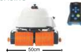
MP3 M Suction: 50m3/h. Weight 22 kg. Cleaning speed: 10 m/min.