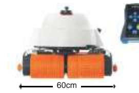
MP3 L Suction: 50 m3/h. Weight 23 kg. Cleaning speed: 12 m/min.