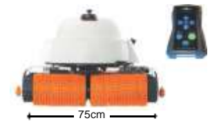
MP3 XL Suction: 50 m3/h. Weight 24 kg. Cleaning speed: 14 m/min.